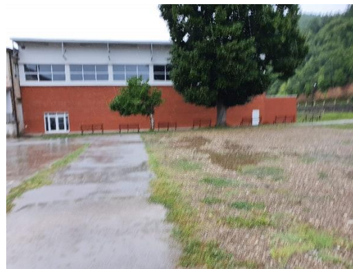
School buildings (Main building and sports hall)