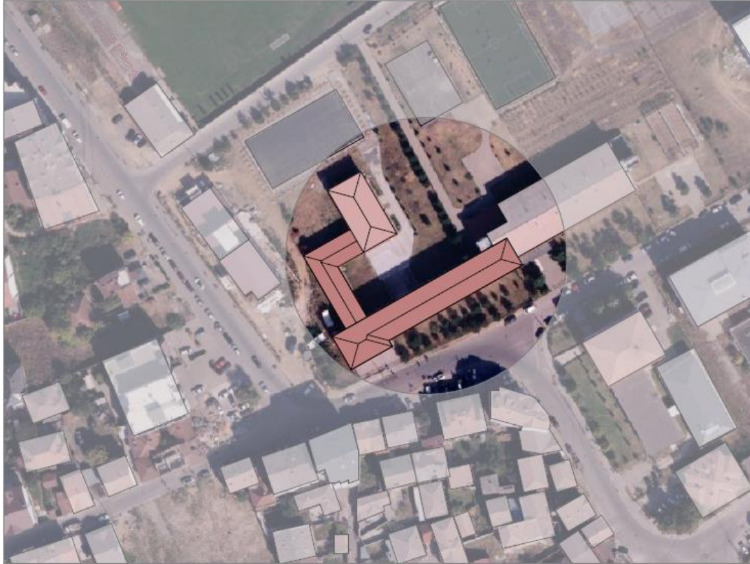
Site Plan of the school