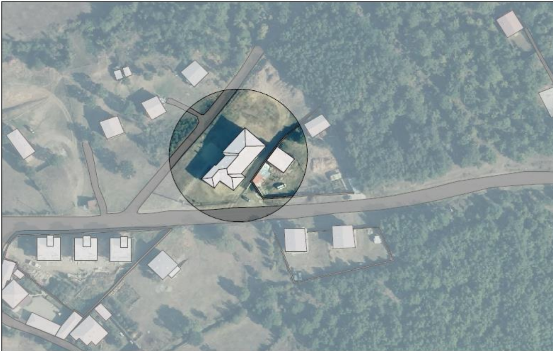
Site Plan of the school