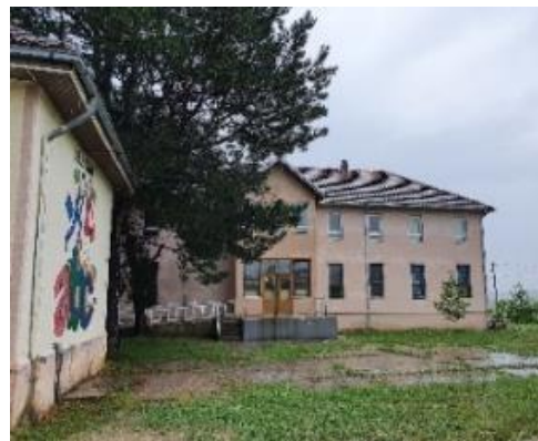
School buildings (Main building and annex building)