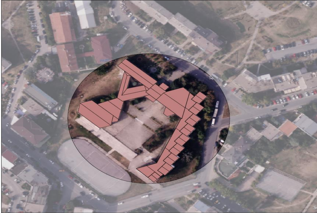
Aerial picture of the school