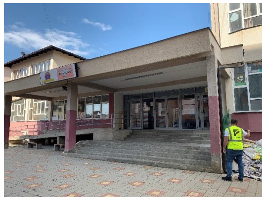
School buildings (Two main building entrances)