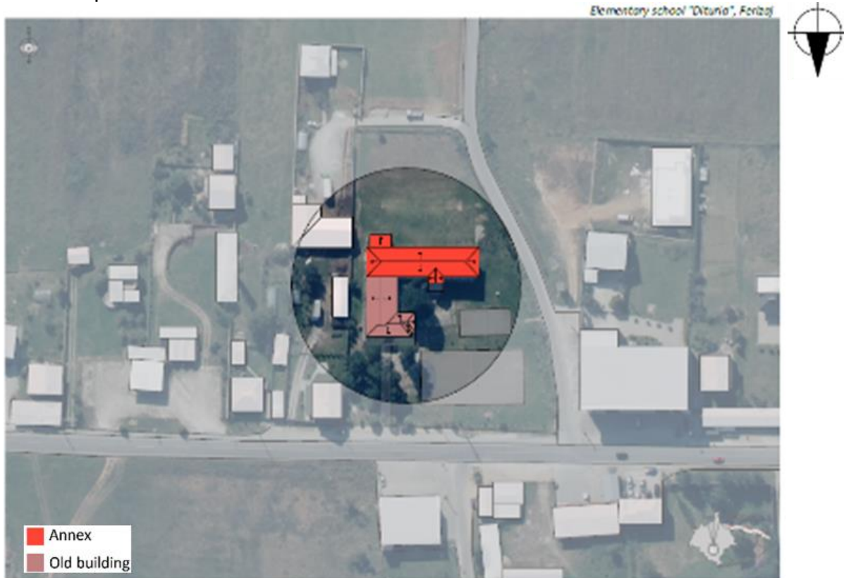
Site Plan of the school

The "Ditturia" school is located in the Dardania village, on the Ferizaj-Gjilan highway, in the Ferizaj municipality. The facility was built in 1962. It is composed of a single-story building dating of 1962 and an extension of two stories built in 2000 (ground floor) and 2010 (first floor). The school has 390 students in total and the maximum number of students per class is 26.