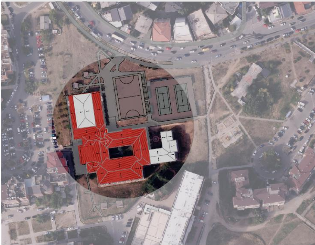
Aerial picture of the school