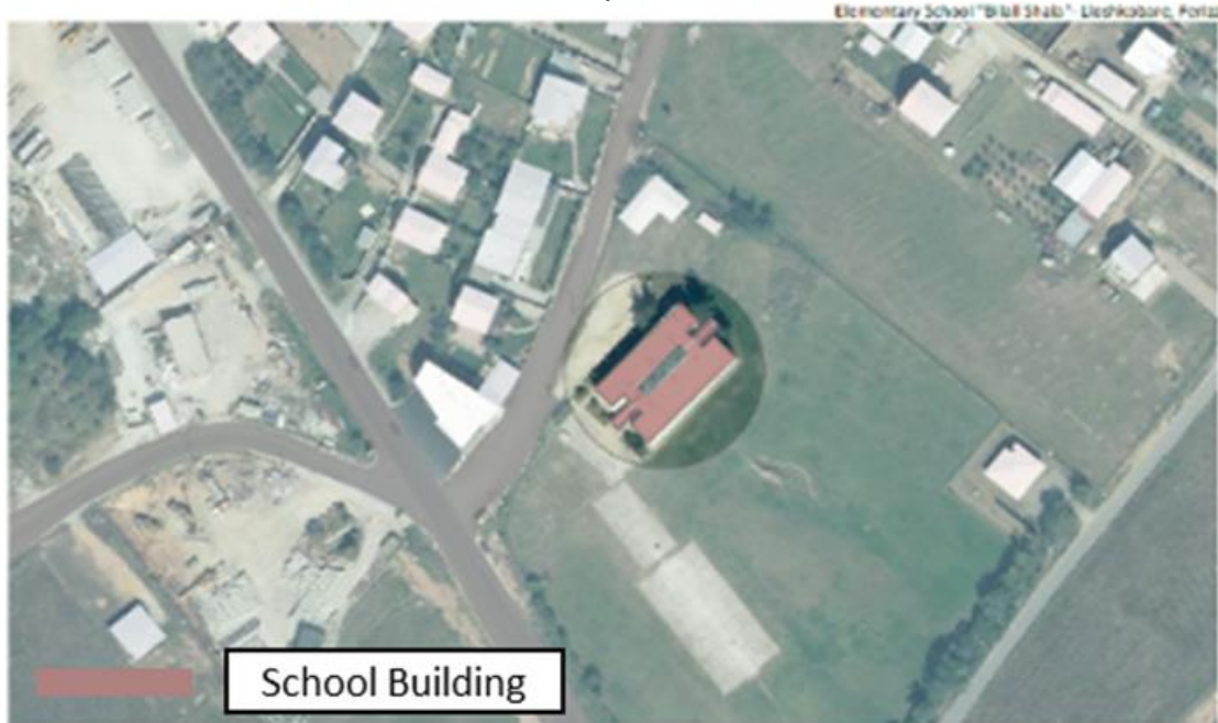
Site Plan of the school

The "Bilall Shala" school is located in the Lloshkobare village, Ferizaj-Shtime highway, in Ferizaj municipality. The facility was built in 1972. The school has 272 students in total and the maximum number of students per class is 28.