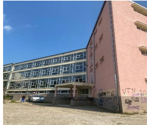
School buildings (Two main building entrances)