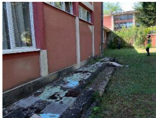
School buildings (Main building and annex building)