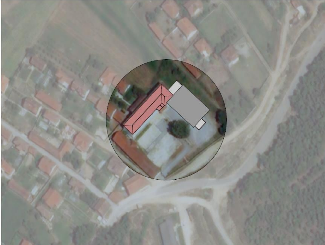
Site Plan of the school