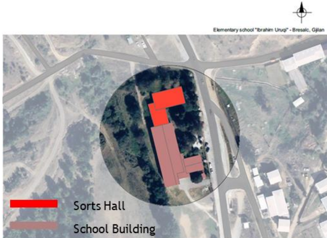
Site Plan of the school

The "Ibrahim Uruqi" school is located in the Bresalc village, in Gjilan municipality. The facility was built in 1974. The school is composed of one building with two stories, a partial basement and sport hall. It has 300 students and the maximum number of students per class is 27.