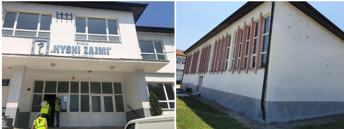
School buildings (Main building and Sports Hall)