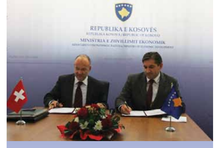
Over 2.7 million Euros for quality water supply in the rural areas

Pristina, 2 December 2011 – Ministry of Economic Development (MED) has signed a co-financing agreement with the Swiss Office for Cooperation for the Project "Rural Water and Sanitation Support Program, Phase IV" to be implemented in the Southeastern Kosovo.