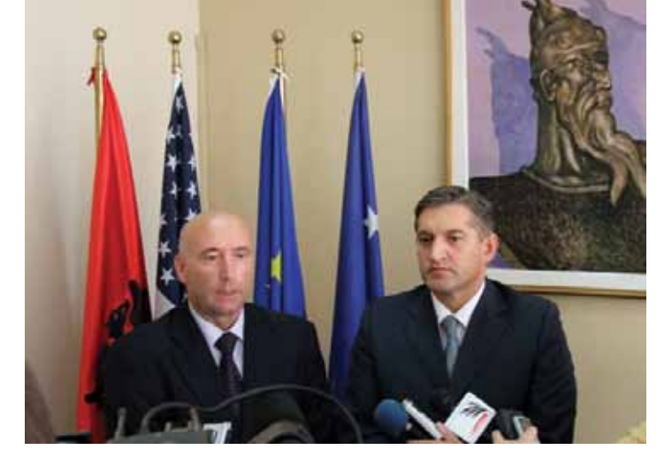
Beqaj: Reciprocity Measures have produced a positive effect

Peja, 18 August 2011 – Reciprocity measures have generated extremely good effects, particularly for the Municipality of Pejë, as the production enterprises have an increased production, and people are consuming local quality products, said the Economic Development Minister, Besim Beqaj.